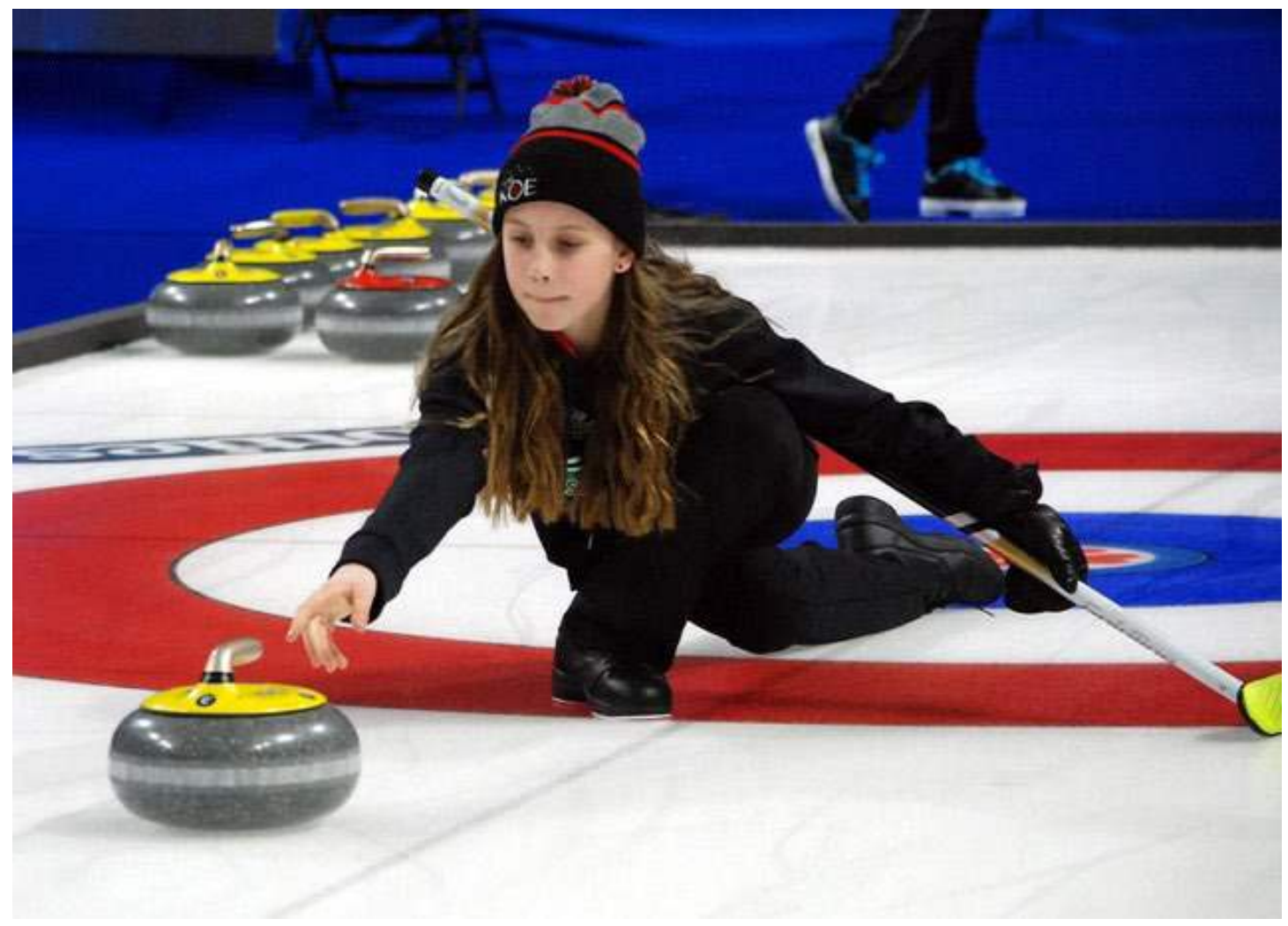
FILE PHOTO: Youth event at 2020 Scotties Tournament of Hearts.