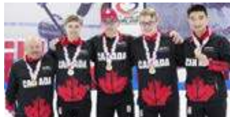
Team Canada & Gold Medalists Team Tao