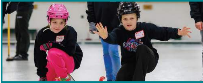
Girls Rock presented by Scotties, a national program introduces girls to the sport in a fun, confidence-building environment.